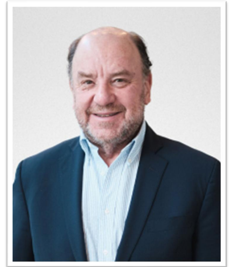
Board Member Falabella S.A. since 2023