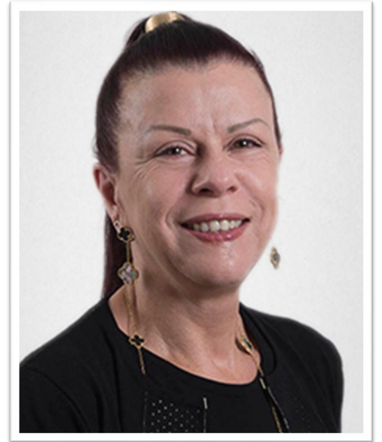
Board Member Falabella S.A. since 2003