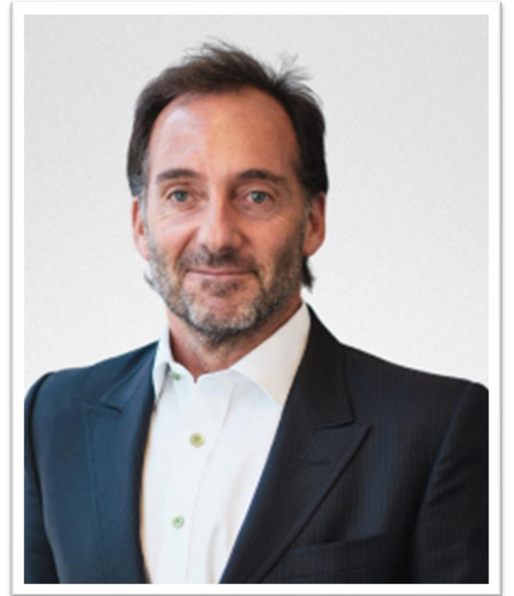
Board Member Falabella S.A. since 2002, currently Vice President