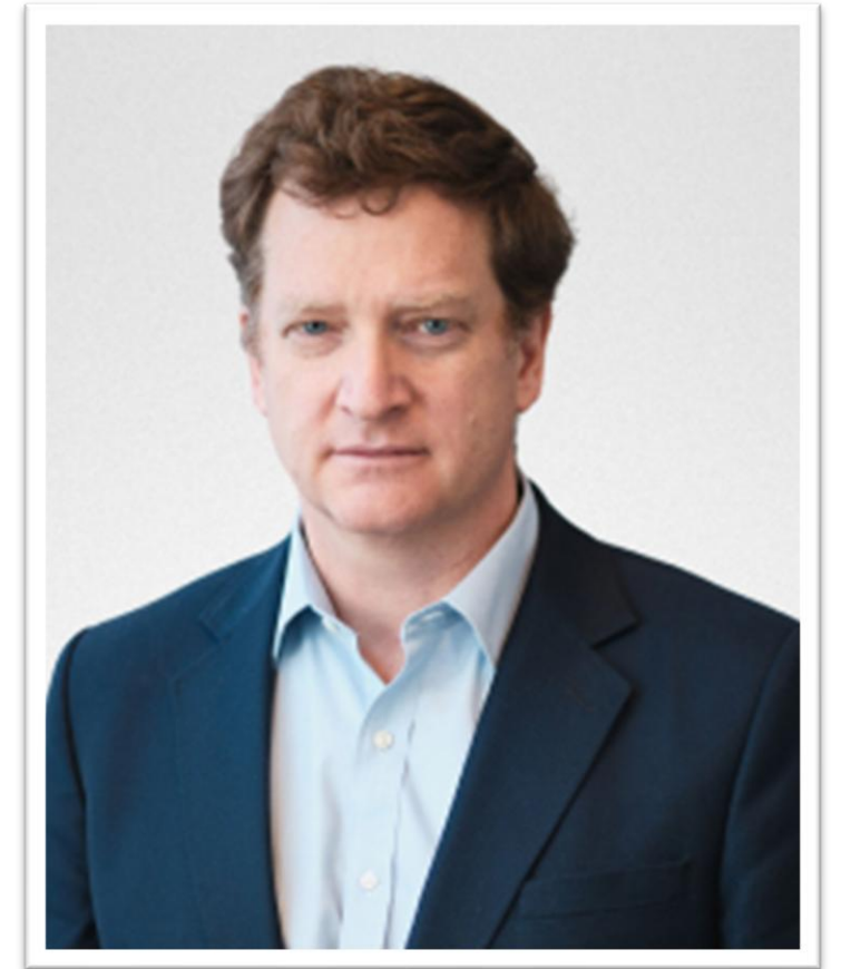
Board Member Falabella S.A. since 2011